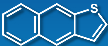
Naphtho[2,3- b ]thiophene (purified by sublimation)